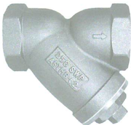
2" YS 52-BZ

Model: YS 52-BZ Cast Bronze • ANSI Class 250 Size Range: 1/4" thru 3"